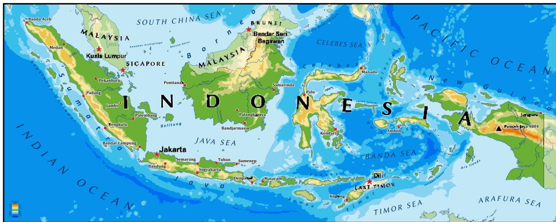
Figure 1: Map of Indonesia