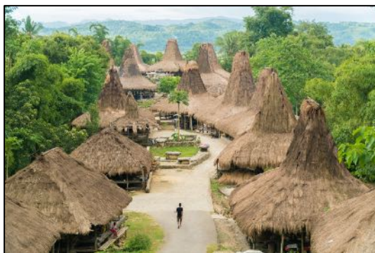
Figure 3: Traditional Kampung