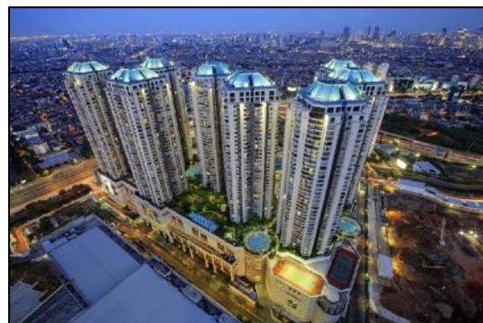
Figure 4: Jakarta apartment towers