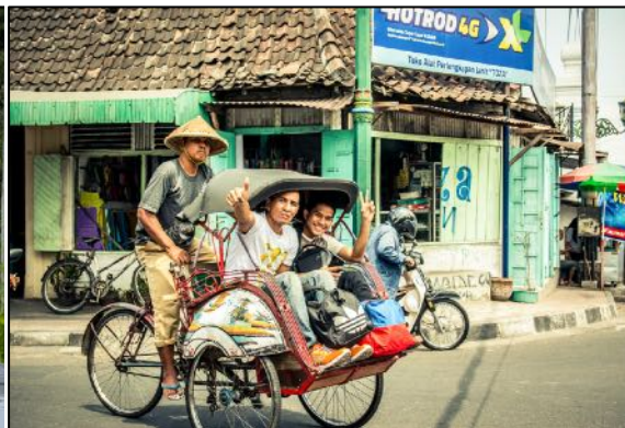
Figures 6 & 7: Examples of more traditional forms of transport, an ox-drawn cart and a becak