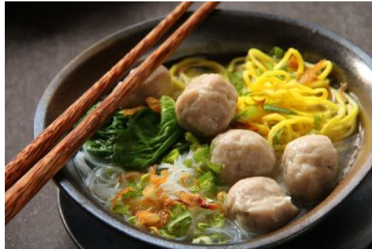
Figure 5: Mie Bakso, a popular Indonesian dish of noodle soup with meatballs